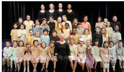
International Opera Theater Young Company