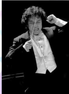
Yoonhak Baek, Conductor (Republic of Korea)