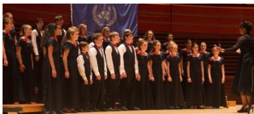
Chester County Youth Choir & Chorale