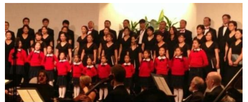
Philly Camerata Choirs