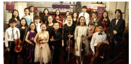
Gloria Youth Orchestra