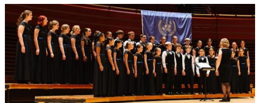
ChildrenSong of NJ