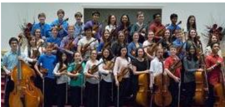
ArCoNet Youth Orchestra

Harness the Power of Music to End Conflict and Violence