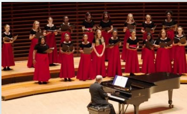
Philadelphia Girls Choir