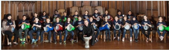
The Muffet School Drummers