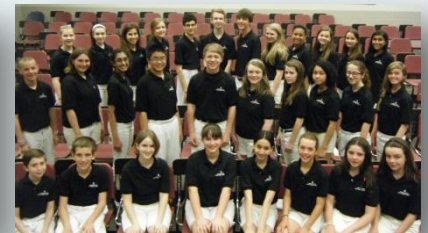
Chester County Youth Choir & Chorale