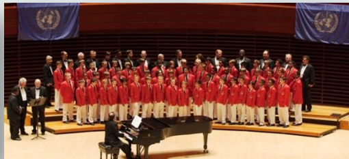
Philadelphia Boys Choir & Chorale