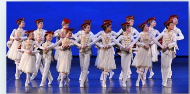
Metropolitan Ballet Academy